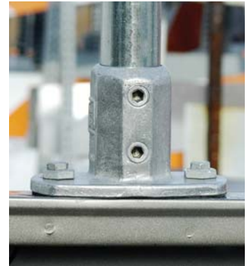
Above: Use of Kee Lite L62 fittings for upright bases give a stylish look. Gaskets like the one shown are available for Kee Lite base fittings.